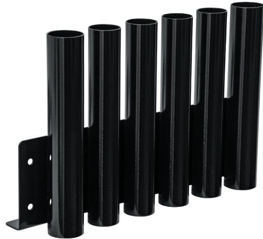
Fig. 1 - Installed Up

7. Assemble the Hand Tool Rack to the Trailer Rail with chosen fasteners.