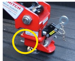
Figure 3: Shift Lock coupler in locked position correctly