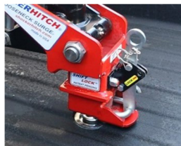
Figure 2: Shift Lock coupler lowered on gooseneck ball