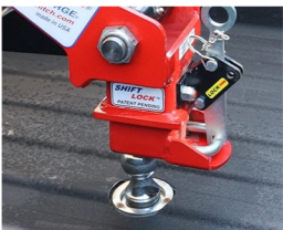
Figure 1: Shift Lock coupler in unlocked position