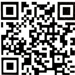
HOW TO SET AIR PRESSURE