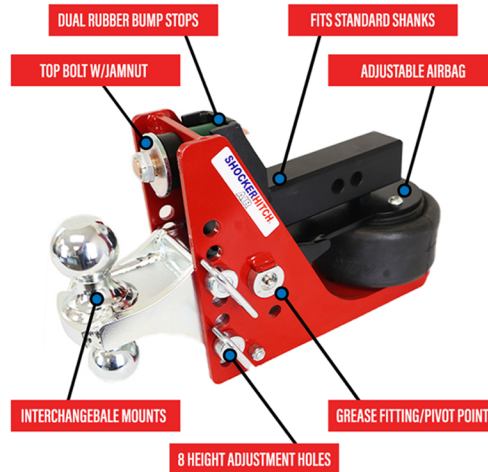
12K AIRBAG HITCH 12,000 LBS GTW - 1,200 LBS TW