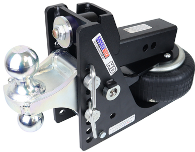
20K MAX BLACK HD AIRBAG HITCH 20,000 LBS GTW - 2,000 LBS TW