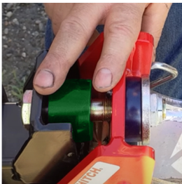
Figure 1: Not enough air - add more air