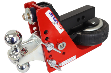
20K HD AIRBAG HITCH 20,000 LBS GTW - 2,000 LBS TW