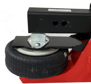
Figure 5: Install using provided allen wrench and existing airbag bolts