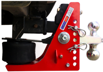
Figure 3: Paddle is level - spacer block NOT necessary

The spacer block is designed for 2" receivers that have a "deep frame", the primary function is to level the upper airbag mounting plate, or "paddle", and keep the airbag at its proper operating height. Due to variances in truck receivers, the usage of the spacer block may vary. Check out the diagrams below to determine which installation matches your needs (see Figures 3, 4, & 5).