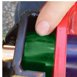
Figure 2: Bump cushions touching - stop adding air