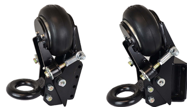
PINTLE RING SIZE - 6" OD x 3" ID