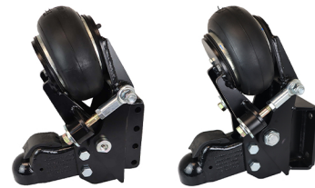
CAST 2-5/16" HD DEMCO COUPLER